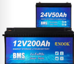
12V & 24V SERIES ENERGY STORAGE LITHIUM BATTERY