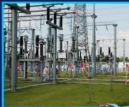
Power Station energy storage