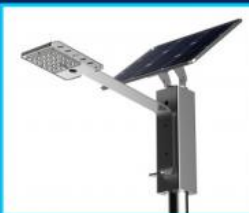
Solar Street Lighth