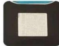
Complete QR Code