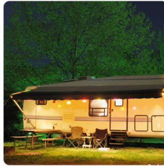
RV Energy Storage